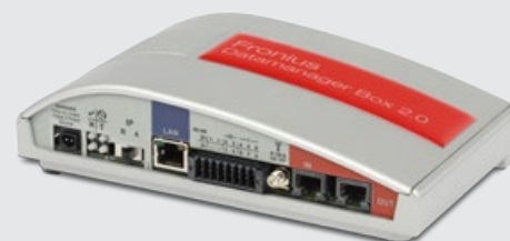
/ Fronius Datamanager Box 2.0